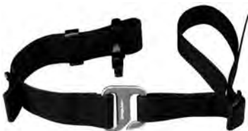
6061-T6 alloy hook strap x 4

New fitting straps for 2011. 4 x 20mm web loops attach to the bike's subframe. Easy on/off via 4 x alloy hooks with no loose straps left on the bike. Also works with US-20 and US-10. (See US-Hook strap page).