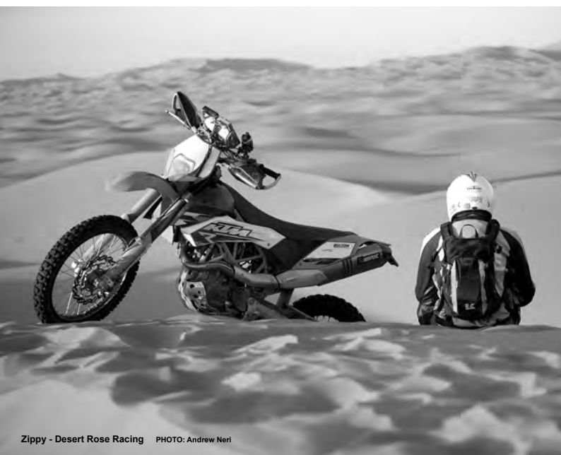
Zippy - Desert Rose Racing

The pack is supplied pre-adjusted to level 2 on the harness straps. This harness position will fit the majority of riders. Adjust to level 1 for XS and level 3 for XL fit.