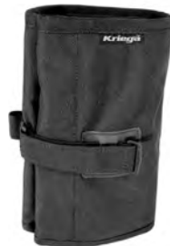
Removable Cordura tool roll

8-litre capacity (6L main-body, 2L side-pod)